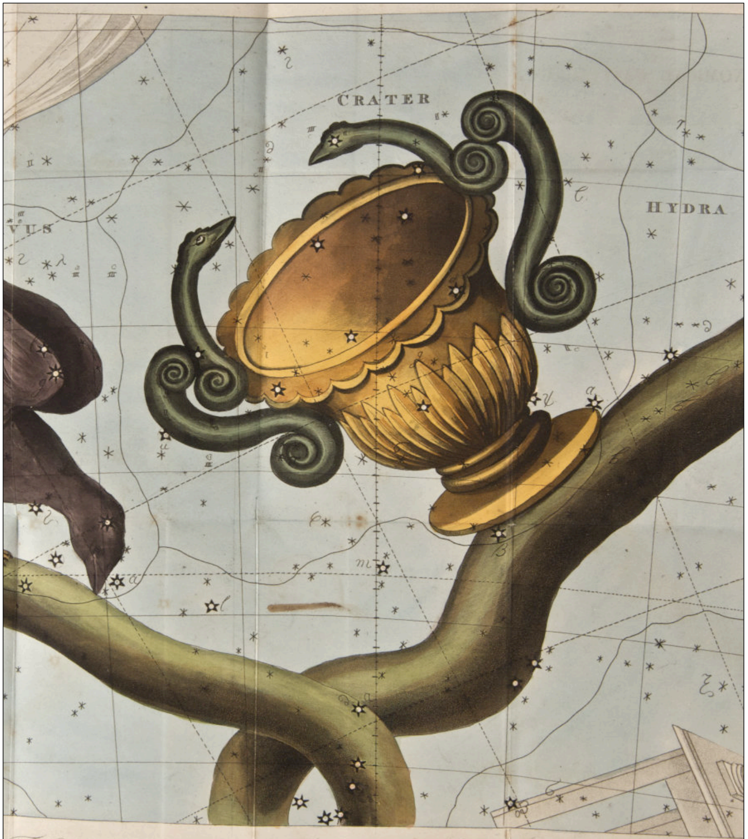
Catherine Whitwell, An Astronomical Catechism (London, 1818)

Exhibit: Galileo's World | Gallery: The Sky at Night | No.: 19